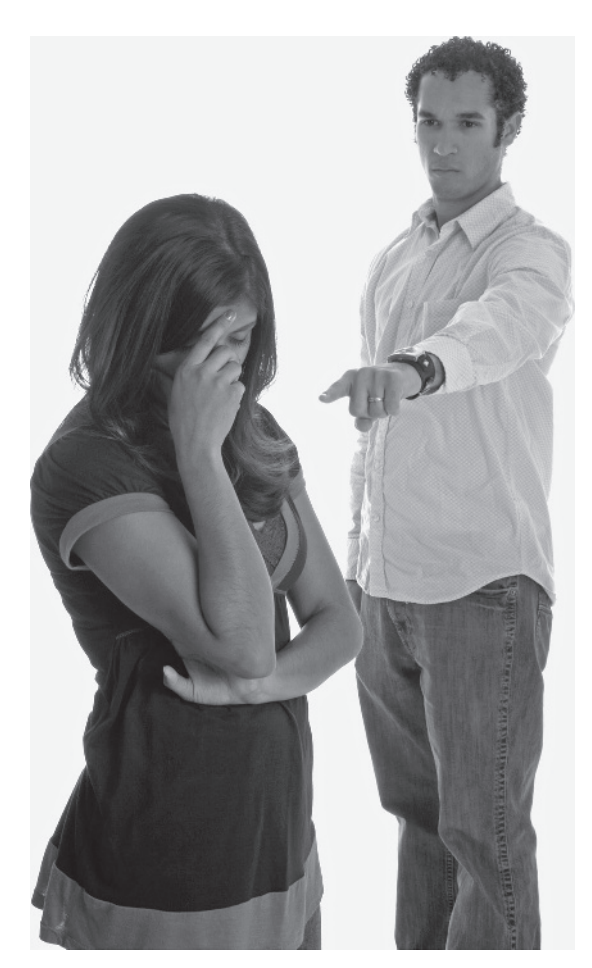
FIGURE 1-1 Eliminating violence against women begins with an examination of patriarchal attitudes.

over the treatment of women within the home and outside. Later in this text, various forms of violence will be defined, along with response options available in the United States. Theoretical explanations are included. An in-depth examination of the criminal justice response to family violence will follow.