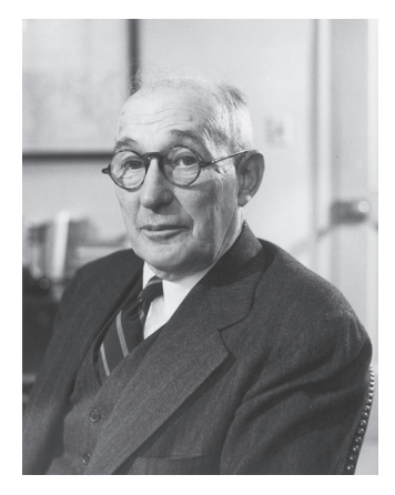
Arthur W. Page was an early proponent of authenticity and transparency in American public relations.

Do Page's principles apply any more or less in the digital age?