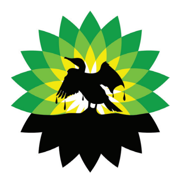
Following the BP oil spill, web users competed to design the best mock logo for the company.

What comes to your mind when you see the BP logo?