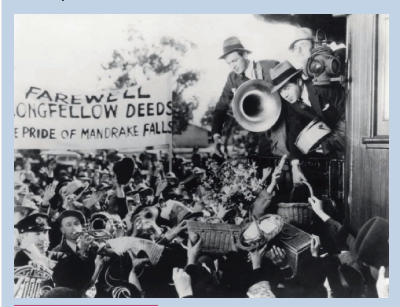
1–5 MR. DEEDS GOES TO TOWN (U.S.A., 1936) with Gary Cooper (with tuba), directed by Frank Capra. (Columbia Pictures)

Classical cinema avoids the extremes of realism and formalism in favor of a slightly stylized presentation that has at least a surface plausibility. Movies in this form are often handsomely mounted, but the style rarely calls attention to itself. The images are determined by their relevance to the story and characters, rather than a desire for authenticity or formal beauty alone. The implicit ideal is a functional, invisible style: The pictorial elements are subordinated to the presentation of characters in action. Classical cinema is story oriented. The narrative line is seldom allowed to wander, nor is it broken up by authorial intrusions. A high premium is placed on the entertainment value of the story, which is often shaped to conform to the conventions of a popular genre. Often the characters are played by stars rather than unknown players, and their roles are sometimes tailored to showcase their personal charms. The human materials are paramount in the classical cinema. The characters are generally appealing and slightly romanticized. The audience is encouraged to identify with their values and goals.