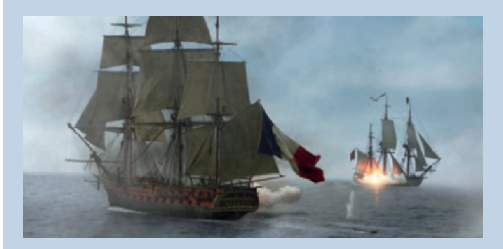
1-1a MASTER AND COMMANDER: THE FAR SIDE OF THE WORLD

(U.S.A., 2003) directed by Peter Weir. (20th Century Fox/Universal/Miramax)