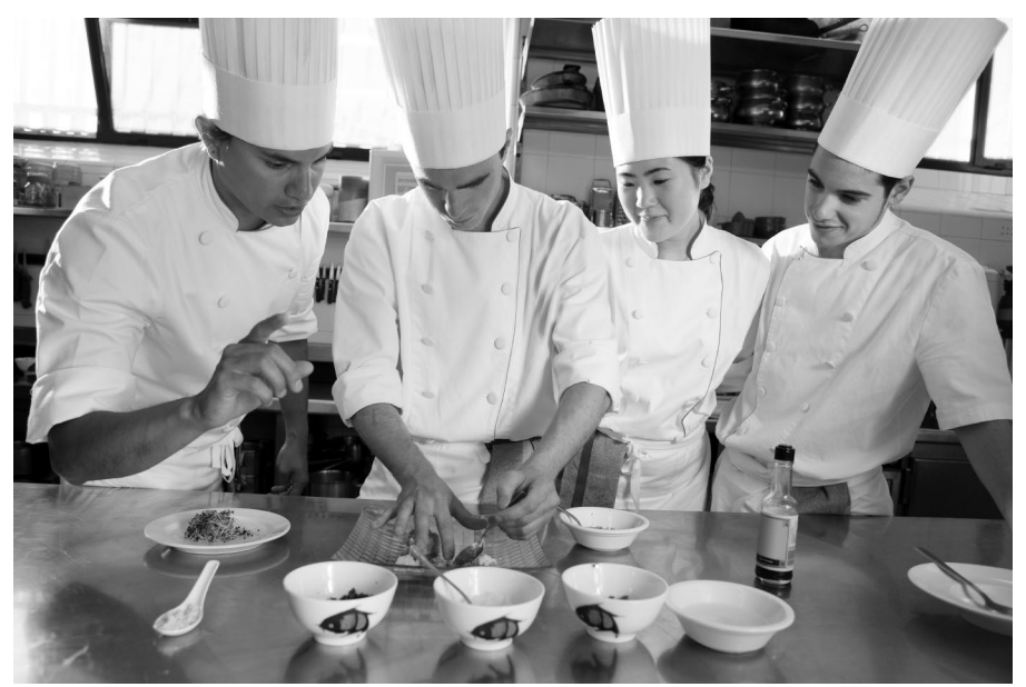
Multicultural work environments are becoming increasingly common in the twenty-first century. In many of these situations, working in small groups is especially important. Given this trend, workers need to learn to deal with cultural differences.