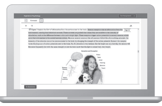
Laptop: McGraw Hill; Woman/dog: George Doyle/Getty Images