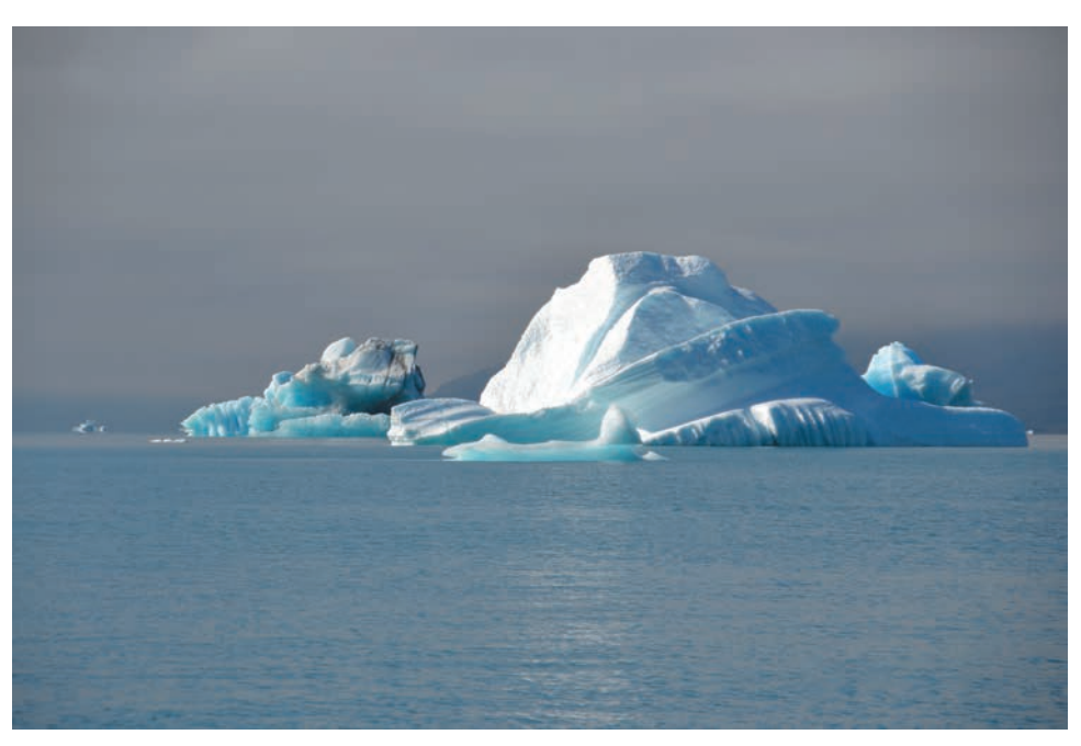
The hidden depth of an iceberg with up to 90 per cent of total mass below the surface