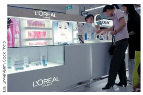
L'Oréal China must sift through a flood of job applications to find the right people to hire.

L'Oréal, the globally known French cosmetics giant, operates in 130 countries. In 2022, it employed over 88,000 people world-