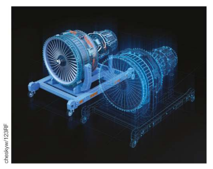
With innovations such as digital twins that simulate their physical counterparts, the smart factories of Industry 4.0 promise greater agility and adaptability in addition to improvements in efficiency and productivity.

The 10th edition of Business in Action tackles all these issues head-on with extensive updates that help students grasp these important topics. The pandemic helped accelerate the transition to the digital enterprise concept that we introduced in the 9th edition, and this new edition keeps that conversation moving forward with the latest advances in innovative, data-driven business technologies.