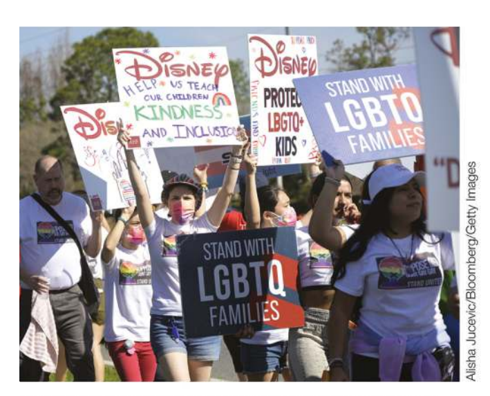
Disney is just one of many corporations that have been drawn into political disputes in recent years.

The business world that students will enter or reenter upon graduation has changed dramatically from just a few years ago. The concepts of remote work and hybrid work models have gone from rarity to mainstream. Leaders find that conventional motivational techniques are no longer as effective as the pandemic gave millions of employees the opportunity to step back and reevaluate their relationship with work. Companies are expected to take a stance on public controversies that continue to divide the population. Virtual reality is spreading from the gaming universe and isolated business applications to the intriguing idea of conducting business in the metaverse. The pandemic disrupted supply chains to such an extent that many firms are rethinking their entire operations strategies. The use of artificial intelligence to enhance or replace human activities in business continues to grow.